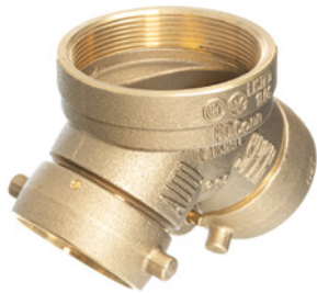
MODEL LV-FDC-S THREADED OUTLET