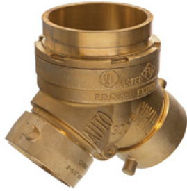
LV-FDC-S- GROOVED OUTLET