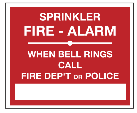
TYPE 3 RECTANGULAR OR ROUND