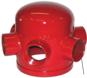
Female NPT Threads