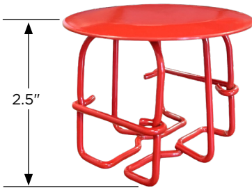
MODEL LVHGBS 1-Piece Headguard w/Baffle

*Note: The 1-pc head guard with shield will not function properly if installed in the pendent position. For this application use a 1-pc head guard without the shield and a water shield that will thread onto the sprinkler base according to the sprinkler head manufacturers' specifications.